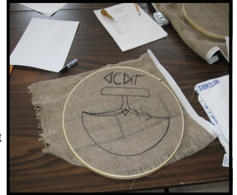
Example of some of the work.

At the end of the two day workshop, each participant was able to take away the knowledge that they had learned the basics of rug hooking, and a kit so that they could continue on to finish the piece they were working on.